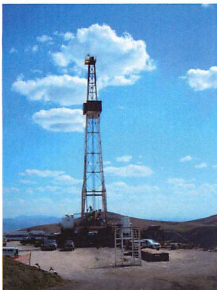
Our New L.C. Moore Drilling Rig

God's Word is full of stories laden with His promises of blessings and prosperity in the land of adversity. So it has been with TRIG. The enemy has tried hard to discourage us. But we have steadfastly trusted the Lord that His Vision's fulfillment is certain. "Then the LORD answered me and said, 'Record the vision and inscribe it on tablets, that the one who reads it may run. For the vision is yet for the appointed time; it hastens toward the goal and it will not fail. Though it tarries, wait for it; for it will certainly come, it will not delay.'" (Habakkuk 2:2-3, NASB)