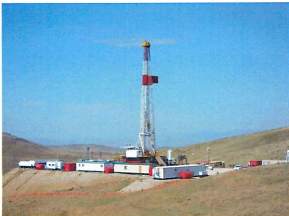
The new rig set up and ready to go at Isaiah 45:3 16-1 drilling site.

We are continuing our "tight hole" strategy. However, we are very encouraged that the CSARI technology we've employed seems to have correctly identified two water zones, three barren zones devoid of hydrocarbons, and two carboniferous zones. The first Isaiah 45:3 16-1 drill hole is in an area previously undrilled. We are in a learning phase relating to true calibration of CSARI data. This data can vary from 28 ft./second to 60 ft./second. The current data indicates our calibration is going to be at the higher end. Therefore we possibly may have to drill to a depth of 6000 ft. to fully test our initial target. Our new rig should be able to handle this easily.